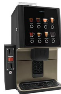
Validator module kit Ready to install a coin validator