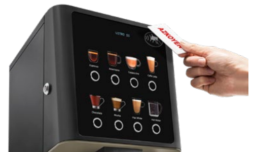
RFID Reader Kit For product recharge card or cashless systems