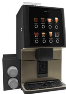
Cup module kit For dispensing cups